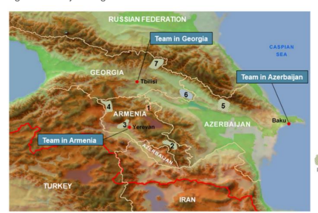
Figure 1: Project region

According to the project proposal, the target group comprised all those in rural areas in the three countries in the South Caucasus that make use or will make use and benefit from ecosystem services. This amounts to about 50% of the population (approximately 1.5 million (Armenia), 4.5 million (Azerbaijan) and 1.8 million (Georgia)). There was a focus on the predominantly poor rural population in the pilot areas. These citizens were directly affected if areas are threatened by erosion or degradation and the viability of traditional land use systems are therefore at risk.