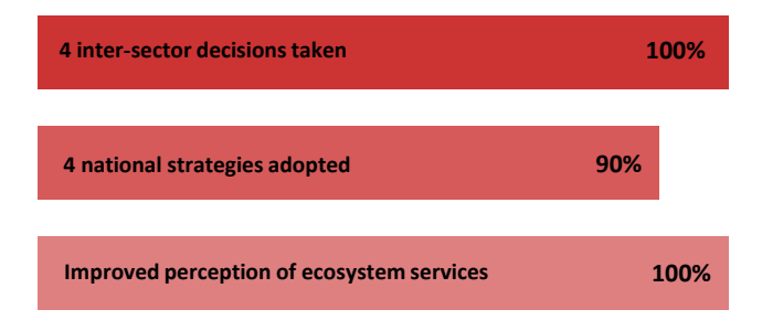
Figure 4: Achievement of project objective indicators

Five positive and two negative unintended project results have been associated with the project on output level. The positive results cover awareness-raising, increased data gathering, changes in policy-making and others. The main negative result refers to the competition between NGOs being influenced by the project. This has been partly addressed by the project even though it is beyond the scope of the project itself. Altogether, there is a significant balance of positive against negative unintended results.